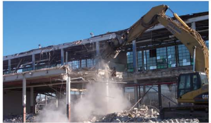
Above: The 84,000SF expansion for Kerry Ingredients and Flavours was constructed on a site that housed an outdated multi-story industrial facility. At Meridian’s recommendation, more than 8,000 tons of concrete and masonry debris generated during the demolition process were recycled onsite and incorporated into the construction of the building expansion resulting in a significant savings to the client.