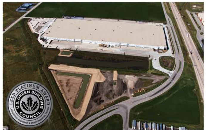
Above: Meridian recently completed its fifth project for WW Grainger, a 1,000,000SF Distribution Center in Minooka, IL. The project incorporated a significant number of innovative sustainable design features and is currently the largest LEED-CI Platinum certified building in the world.